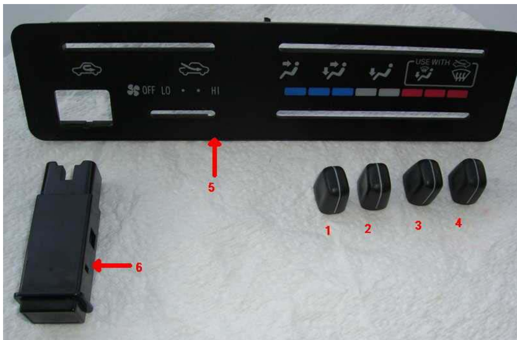
PHOTO SHOWING PIECES REMOVED IN STEP 2

UNPLUG & REMOVE A/C CONTROL SWITCH (6) IF APPLICABLE.